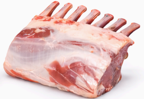
French Rack 50/0 mm