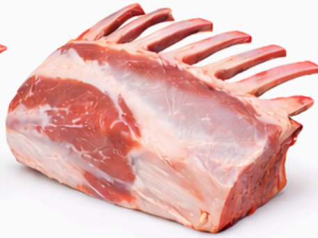
French Rack 75/25 mm Cap Off